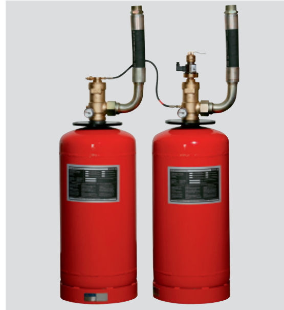
Example of a multi-cylinder system